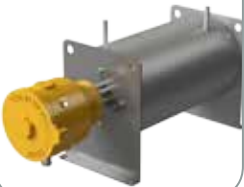
Cast line heaters