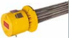
Flange immersion heaters