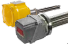
Screw plug immersion heaters